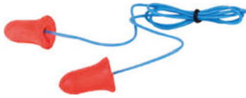
FOAM EAR PLUGS WITH CORD