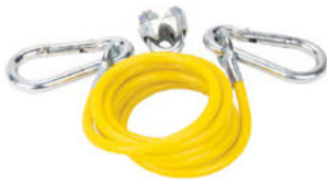
3' - 5' #HOM22