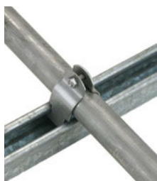
STAINLESS STRUT & CLAMPS