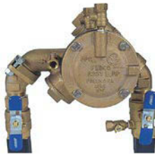
FEBCO #825YA ANGLE PATTERN