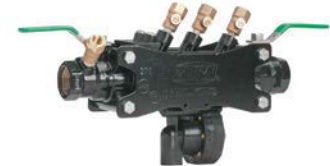
WILKINS #375XL PLASTIC BODY HELPS DETER THEFT