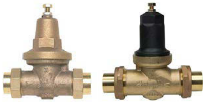
MODEL #70 MODEL #NR3