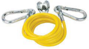
3' - 5' #HOM22